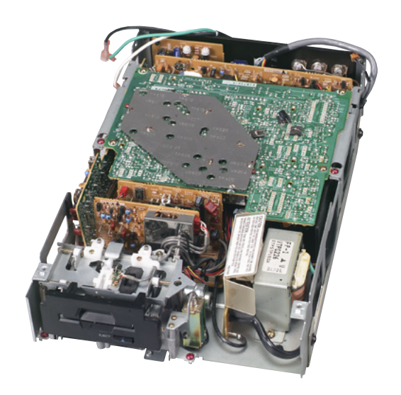
Eastman Kodak Company's old Video Recorder Subsystem.

"Orchid listened to our needs and took up this most difficult and time-sensitive engineering challenge. We are all delighted with Orchid's engineering skill and ability to deliver quality product."