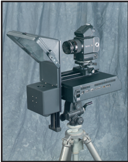
Orchid Embeds Pentium and Pentium II Technology in the most unusual places.

Eastman Kodak Company, an Orchid client, wished to inject new life into its line of professional image capture products. Building upon Orchid's years of embedded x86 / Pentium / Pentium II, multimedia, imaging, and networking expertise, Kodak leveraged a custom Orchid design and kept a crucial market segment, the professional photographer, taking pictures and generating profits.