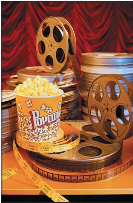
Orchid Technologies delivers On-Demand streaming multi-media content.

The multi-billion dollar set-top-box market requires an agile hardware platform that can answer site-specific installation needs while providing unmatched reliability, and entertainment value. Orchid Technologies designed a feature-packed set top box, raising the bar for features and performance.