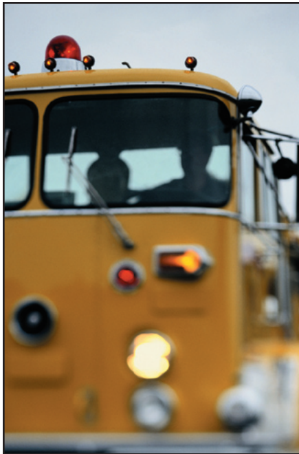
Vigilant 24/7 emergency telecommunications service by Orchid Technologies.

Natural Microsystems, a world-wide telecommunications industry leader, engaged Orchid Technologies to perform the hardware design of their 911-enabled multi-port telecommunications hardware engine.