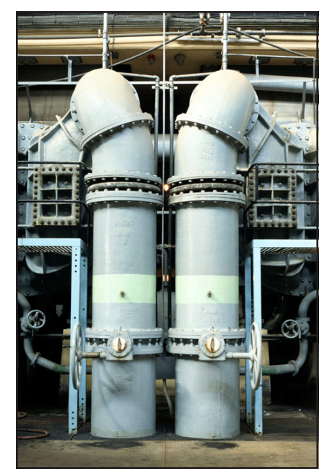
Miniature pressure sensing instrumentation is critical to the proper control of these two ultra-high volume hydraulic actuators.