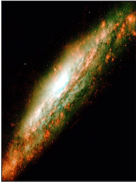
Image processing from Orchid Technologies takes you to the stars.