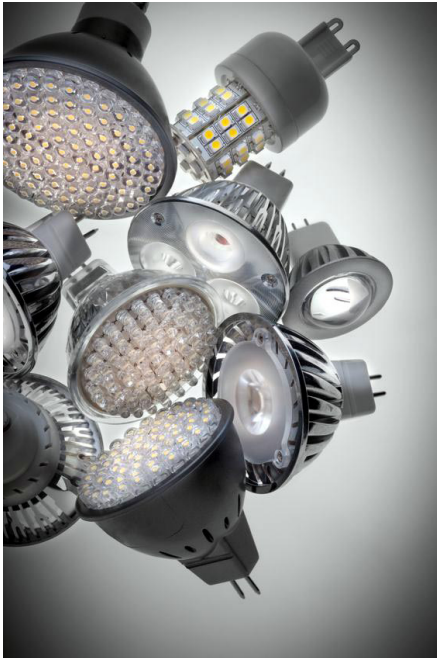
Direct off-line powered radio controlled lighting fixtures create a world of new applications while saving power too.