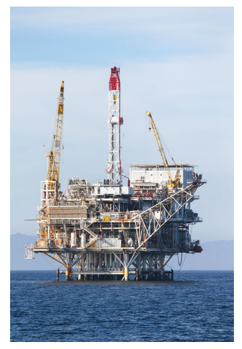
Running 24/7 custom high reliability computing equipment from Orchid Technologies makes exploration safe and efficient.